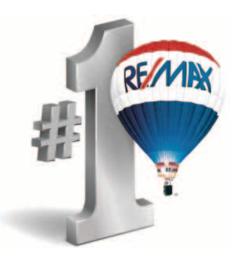
Each Office Independently Owned and Operated

(570) 992-2700 Office (570) 402-8508 Direct