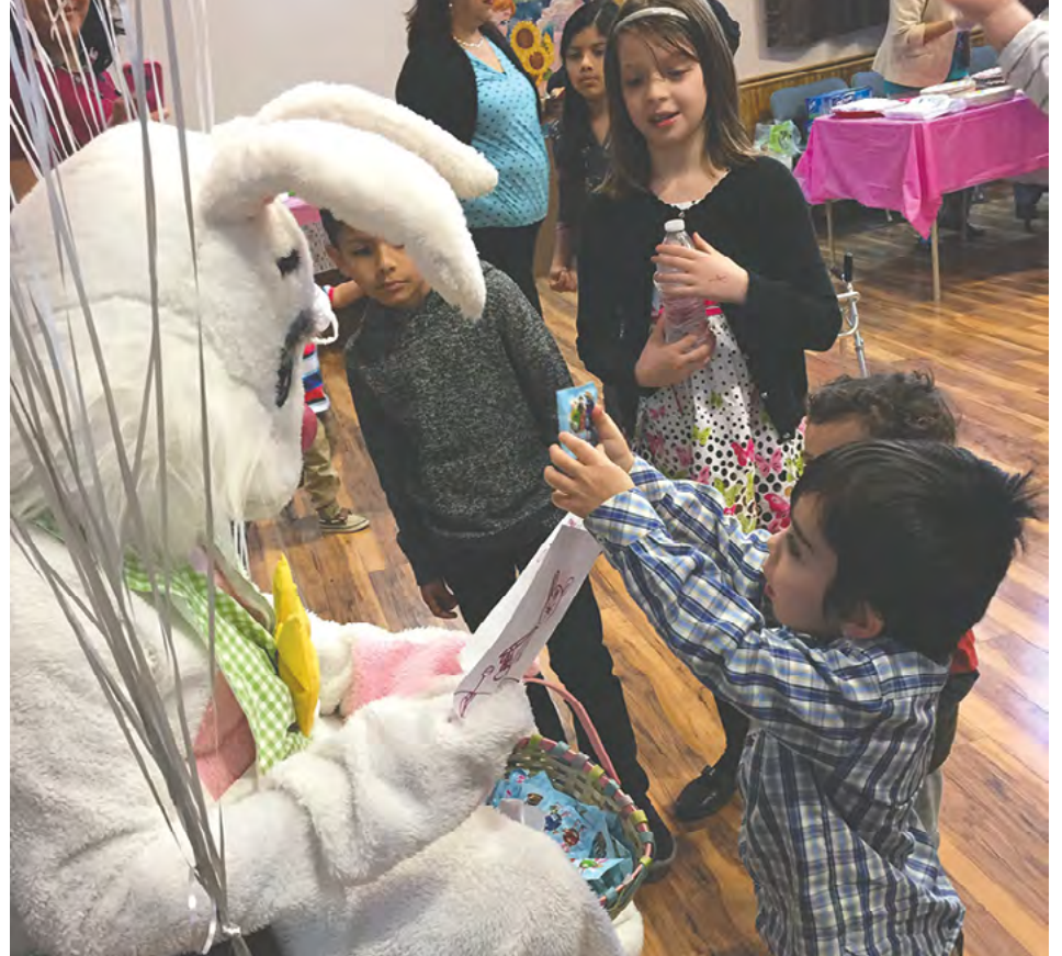
Breakfast with the Easter Bunny - more photos on page 8...

CONCLUSION — For the past six years, the association has run a surplus and held dues static. The Penn Estates Property Association is in a very healthy economic status as it enters 2016.