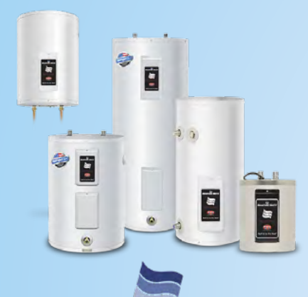
BRADFORD WHITE WATER HEATERS