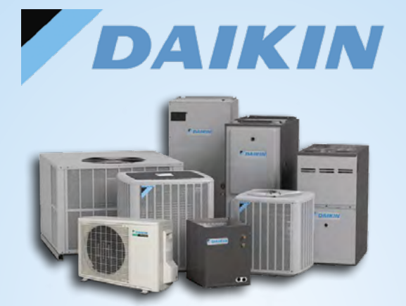
$250 OFF NEW DAIKIN DUCTLESS HEAT PUMP SYSTEM INSTALLS 10 YEARS PARTS & LABOR WARRANTY