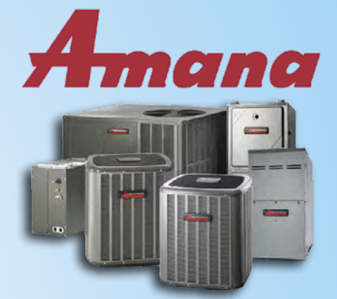
$250 OFF NEW AMANA HVAC SYSTEMS 10 YEARS PARTS & LABOR WARRANTY