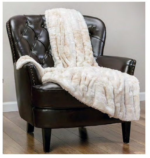
Super Soft Fuzzy Faux Fur Throw Blankets https://amzn.to/3K8r9LP

Leather Travel Duffel Tote Bag https://amzn.to/3M7exWR