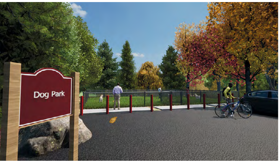
Penn Estates Dog Park to open May 2 - See page 19...

Penn Estates Property Owners Association 304 Cricket Drive East Stroudsburg PA 18301