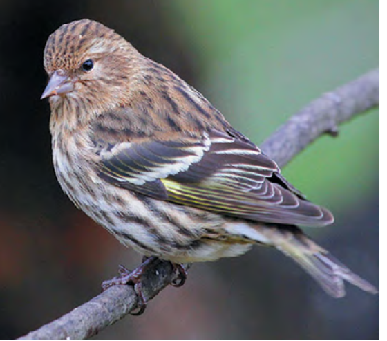
Pine Siskins are similar to female House Finches. They have a more slender bill and yellow can be seen on their wings and tail.

The most common cause of this is lack of food. This year, the cone crop is poor in most of Ontario and the Northeast, where these birds will usually spend their winter. This means that there is a great chance that they can be seen in our own backyards. If you put up bird feeders, be sure to keep them