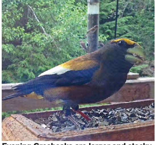
Evening Grosbeaks are larger and stocky compared to the more common American Goldfinch with much larger bills.

Remember to closely watch your bird feeders this winter. A visit from any of these bird species can be a special experience!