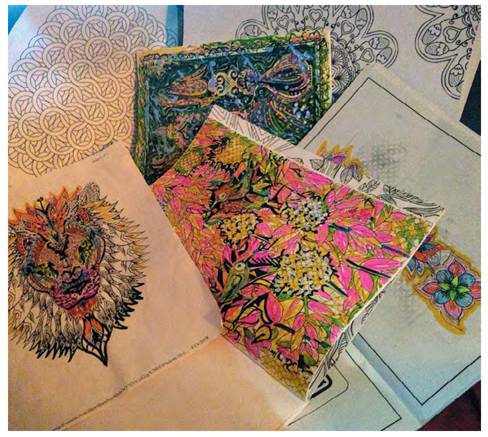
lighters, paint markers and colored pencils I start out with a basic approach but then quickly deviate...as is my artist nature!

I color in the lines! But quickly change up my technique! Using Sharpies, high-